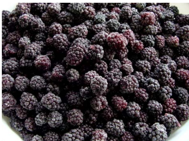
Blackberry Whole , Whole Broken , Block