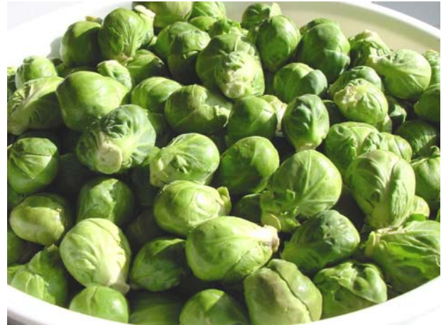
Brussel Sprouts Blanched , Whole