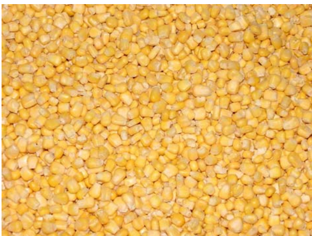
Sweet Corn Blanched