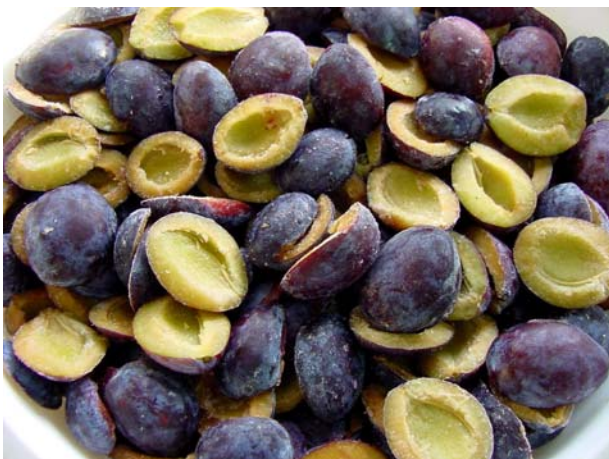
Plum Halves , Diced : 10 x 10 mm