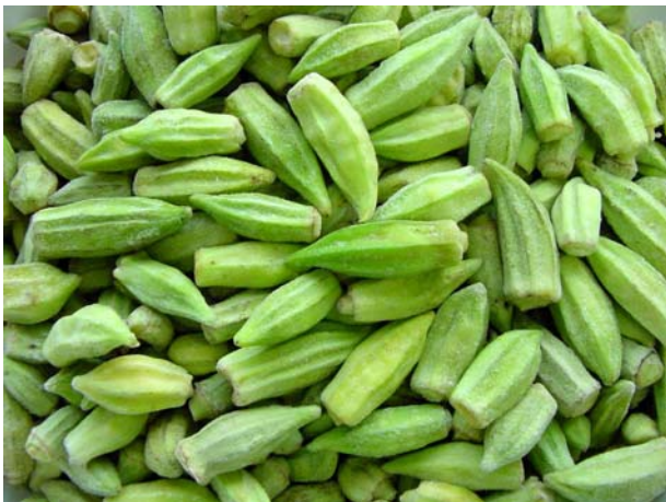
Okra Blanched , Large , Pointed