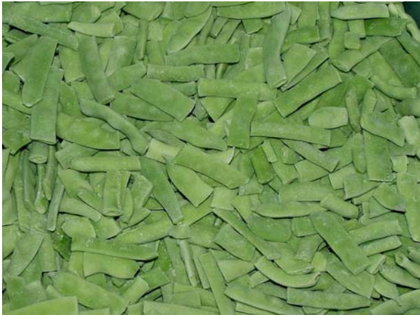
Beans Blanched , Whole , Cut