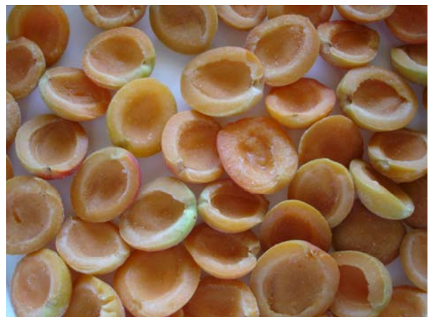
Apricot Halves , Diced : 10 x 10 mm