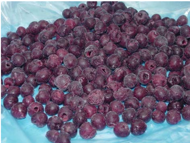
Sweet Cherry Unpitted , Pitted