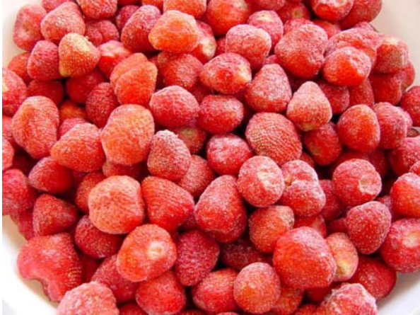
Strawberry Uncalibrated , Calibrated 10-18 mm , 18-22 mm , 22-26 mm , 26-35 mm