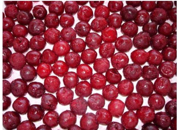
Sourcherry Unpitted , Pitted -18 mm , 18 mm+