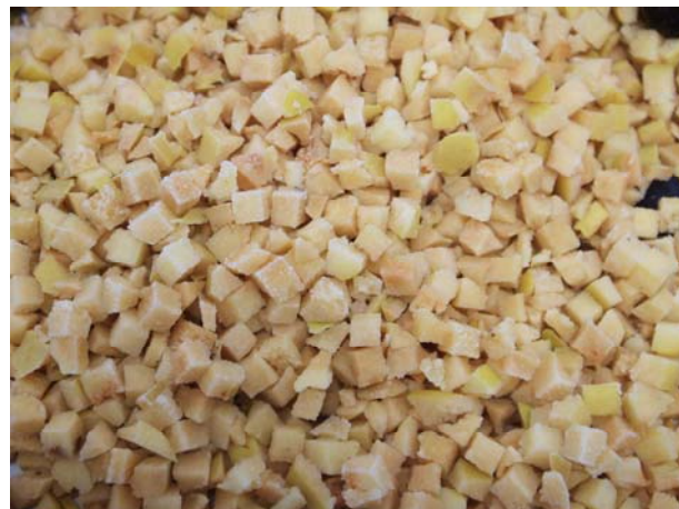
Quince Diced 10 x 10 mm