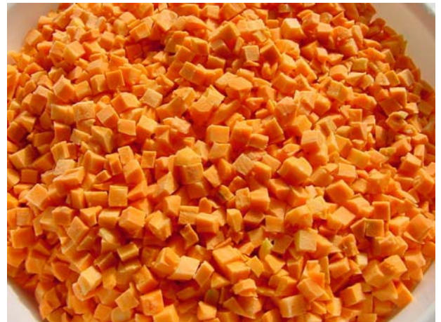
Carrot Blanched Diced : 10 x 10 mm , 15 x 15 mm Roundel