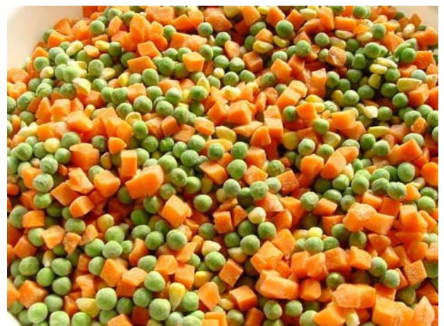
Mixed Vegetables Carrot + Peas + Corn Blanched