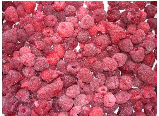
Raspberry Whole , Whole Broken , Block